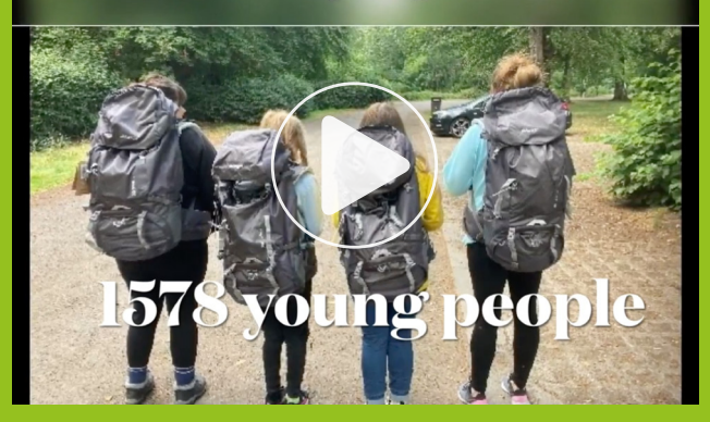
Here is a short video we created to capture our adventures.